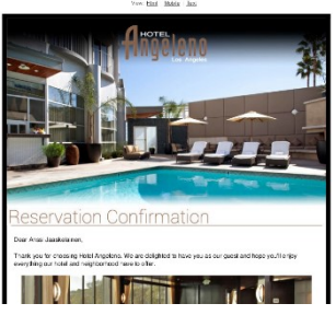
Figure 2: Left, original e-mail in Outlook, right converted PDF/A-3b file

Some might wonder why we have not chosen html 5 or some other more manageable format. With the utilization of PDF/A, it can be ensured that the document remains unmodified after it has been created as well as is rendered identically on all devices. Furthermore, the transferability of the document is superb. Finally, this solution maintain the original look and feel of the e-mail and makes possible the preservation of original metadata and attachments.